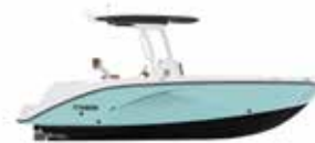
222 FSH SPORT E