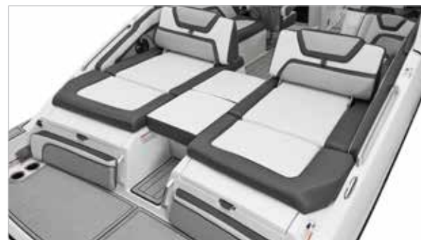
CONVERTIBLE LOUNGER WITH FILLER CUSHIONS