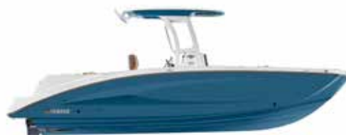
EXTERIOR | SLATE BLUE