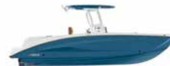
252 FSH SPORT