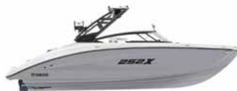
EXTERIOR | MIST GREY