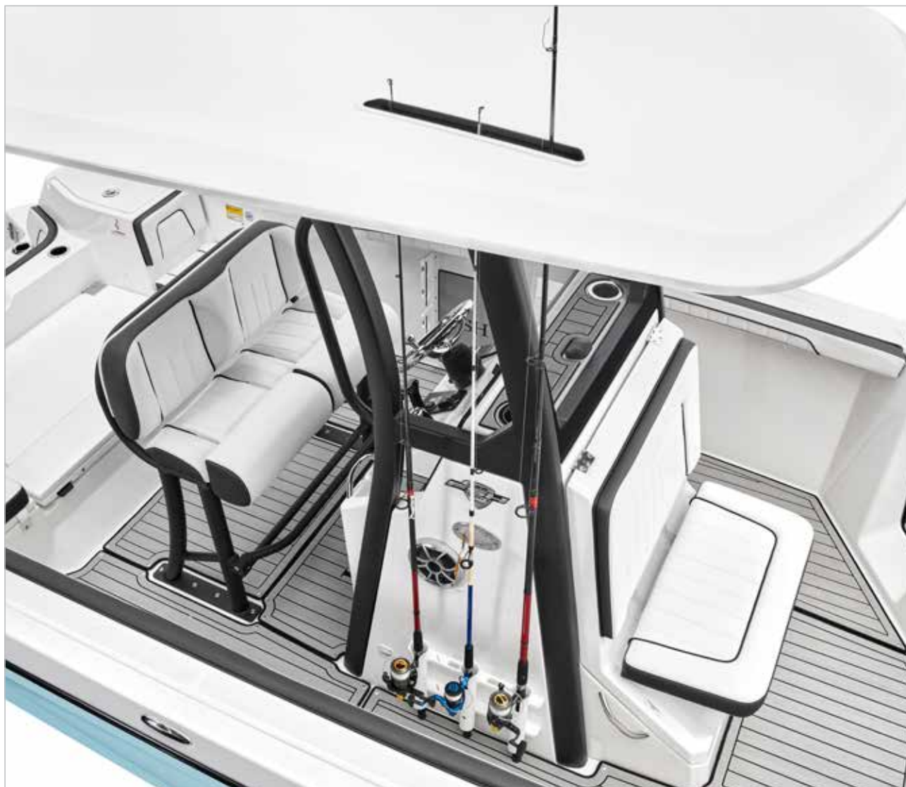
T-TOP WITH ROD HOLDERS