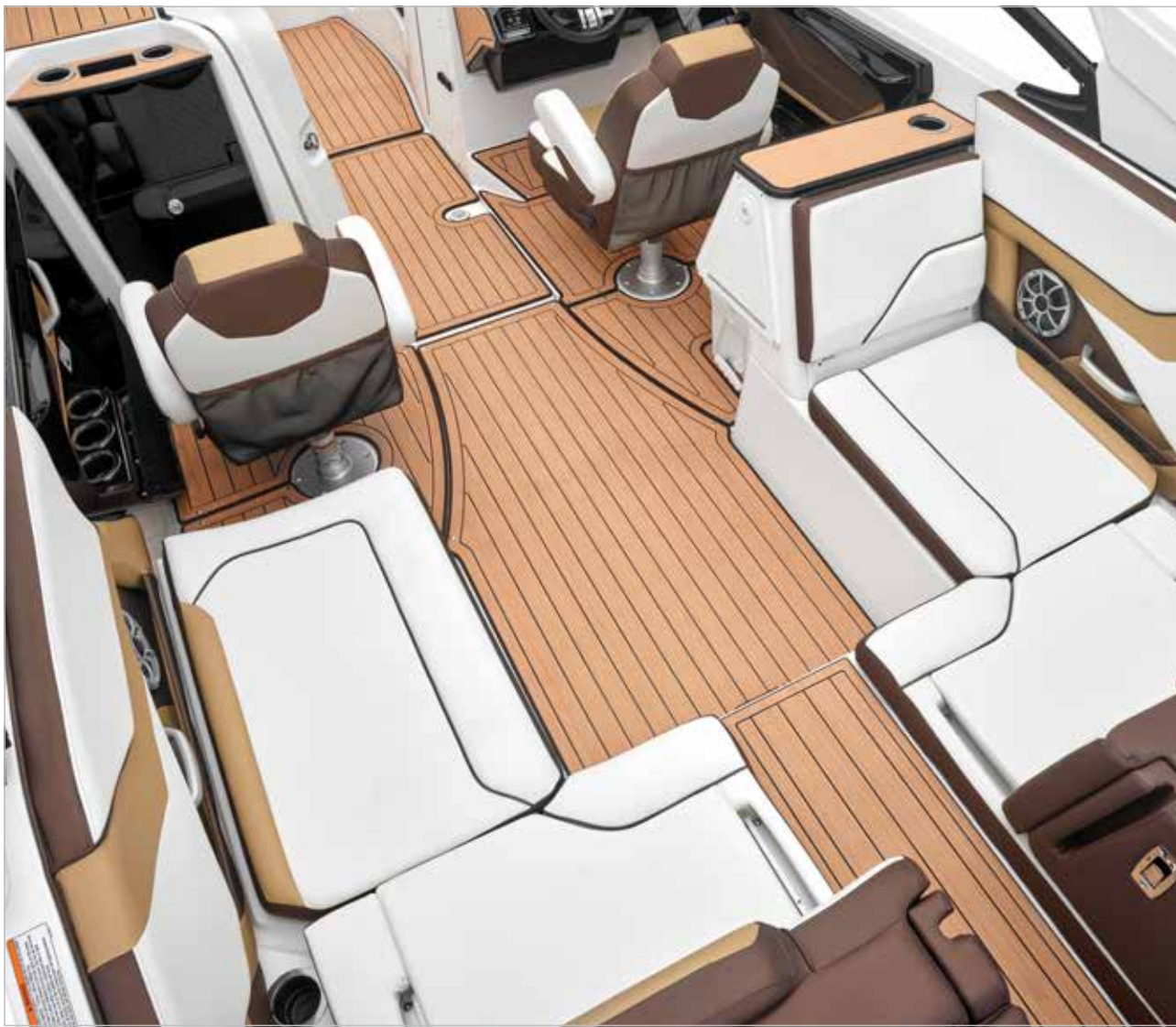
COCKPIT SEATING & MARINE MAT FLOORING