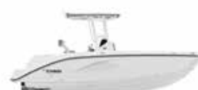
220 FSH SPORT