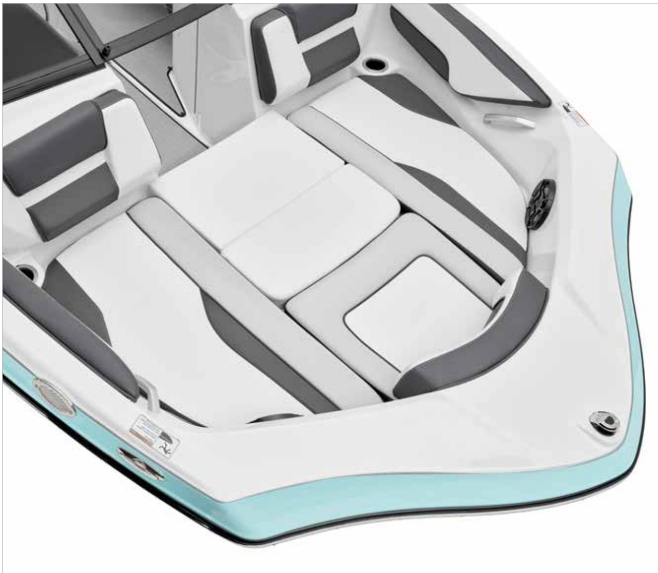
BOW FILLER INSERTS