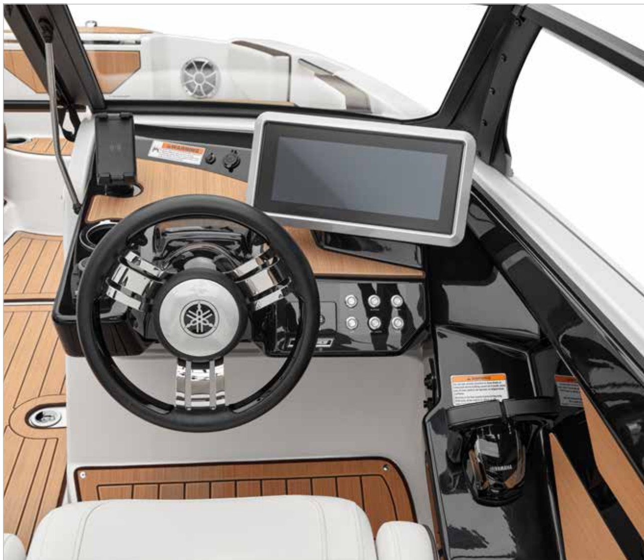
HELM FEATURING CONNEXT & WIRELESS CHARGING