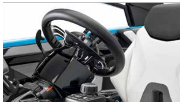
DRIVE FUNCTION FOR LOW SPEED MANEUVERABILITY