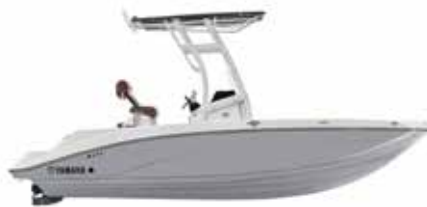
EXTERIOR | MIST GREY