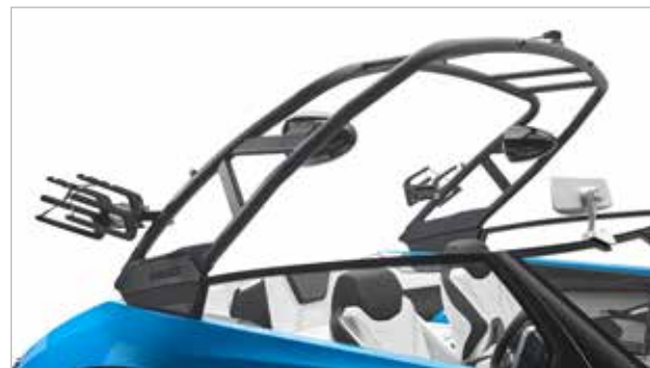
FOLDING WAKEBOARD TOWER WITH TOW HOOK