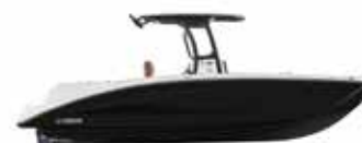
255 FSH SPORT E