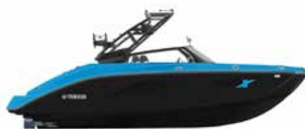
EXTERIOR | SAPPHIRE