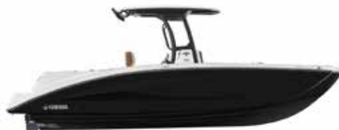
EXTERIOR | BLACK