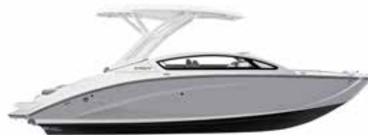
EXTERIOR | MIST GRAY