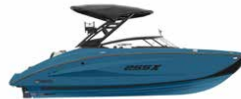
EXTERIOR | SLATE BLUE