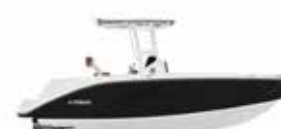
222 FSH SPORT