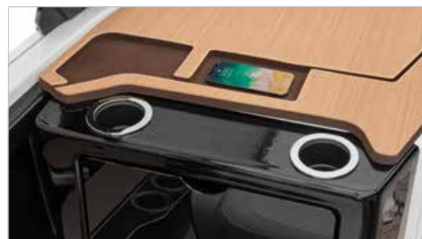
PORTSIDE WIRELESS CHARGING