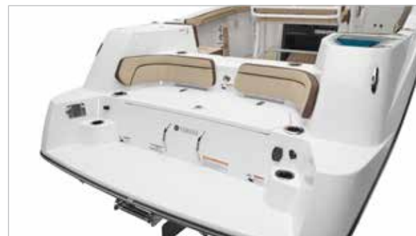
INTEGRATED SWIM PLATFORM