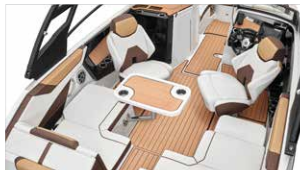
COCKPIT SEATING & TABLE MOUNT