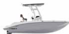
190 FSH SPORT