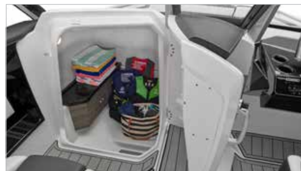
ENCLOSED HEAD COMPARTMENT