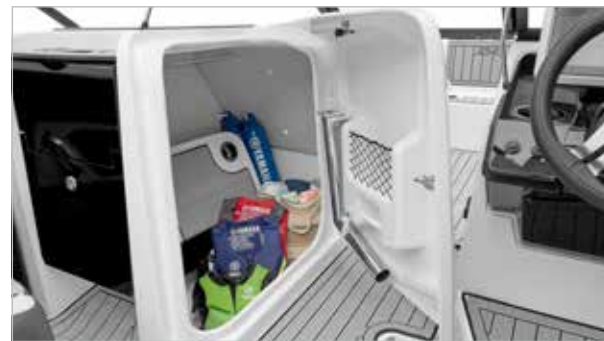
ENCLOSED HEAD COMPARTMENT