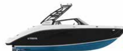
EXTERIOR | BLACK