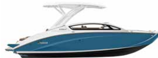
EXTERIOR | SLATE BLUE