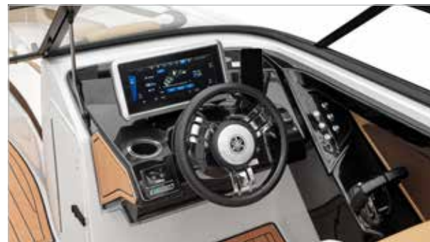
"FLOATING" CONNEXX TOUCHSCREEN