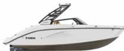
EXTERIOR | WHITE