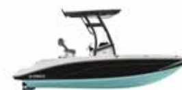
195 FSH SPORT