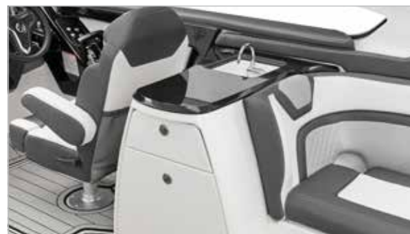
GALLEY WITH LOCKABLE STORAGE