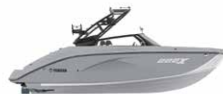
EXTERIOR | MIST GRAY