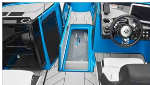
INTEGRATED BALLAST SYSTEM