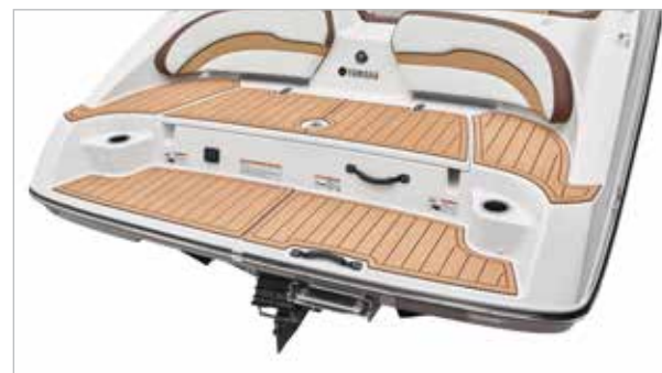
INTEGRATED SWIM PLATFORM