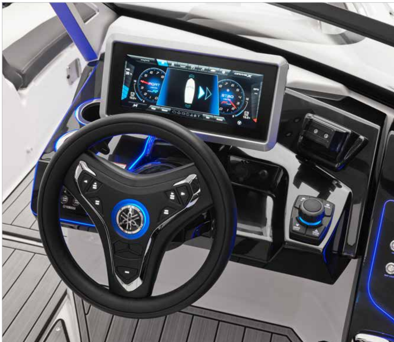
INTRODUCING DRIVE X - LOW-SPEED HANDLING AND DOCK-ASSIST