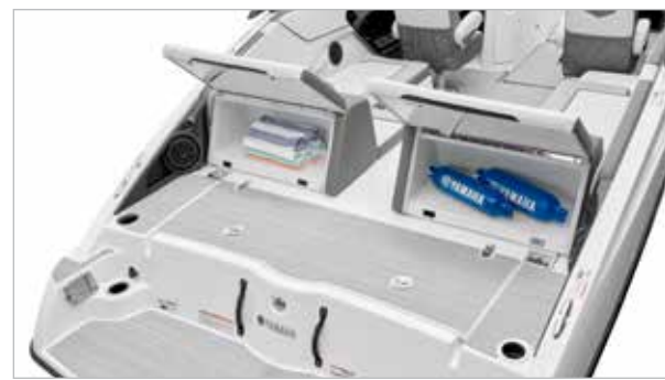
CUSHIONED BACKRESTS WITH STORAGE