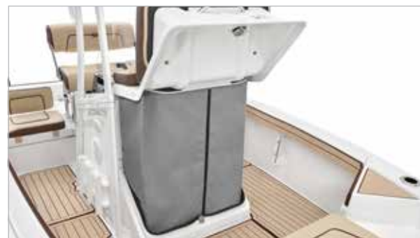
LOCKABLE CONSOLE WITH CURTAIN