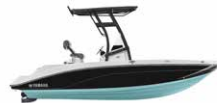
EXTERIOR | BLACK