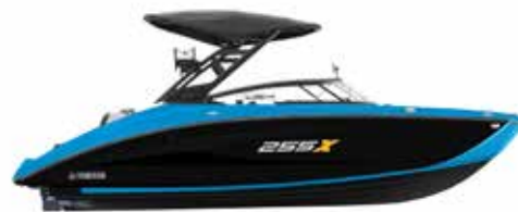
EXTERIOR | SAPPHIRE