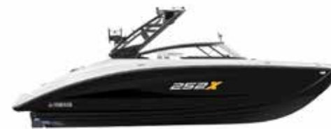
EXTERIOR | BLACK