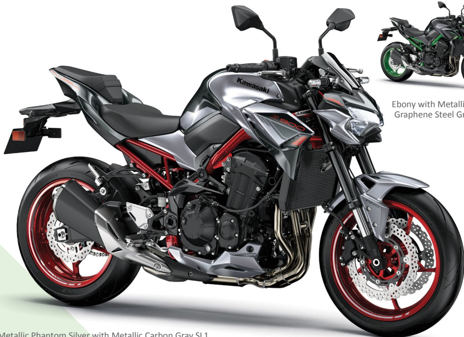
Ebony with Metallic Matte Graphene Steel Gray GY1