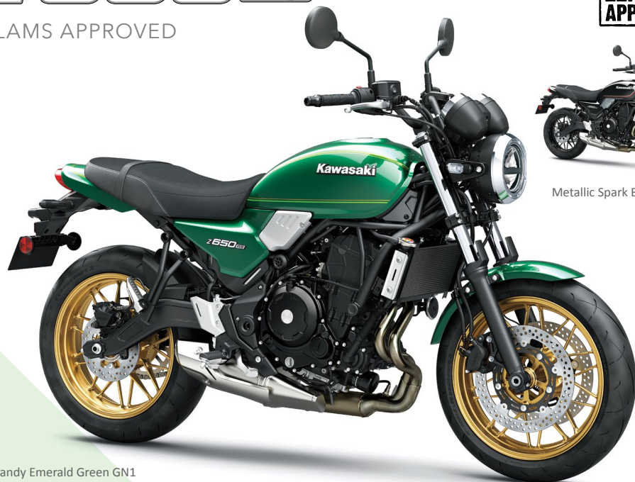
Metallic Spark Black BK1