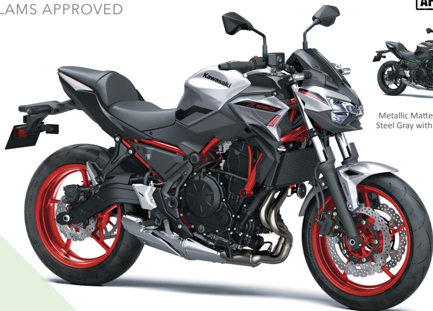
Metallic Matte Graphene Steel Gray with Ebony GY1

Metallic Phantom Silver with Metallic Carbon Gray SL1