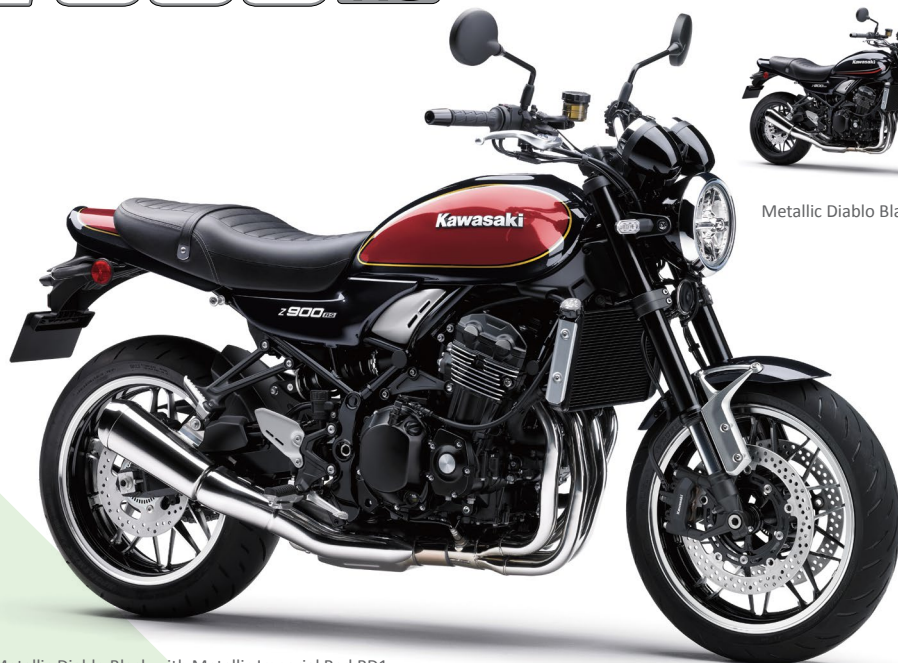
Metallic Diablo Black with Metallic Imperial Red RD1