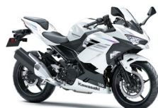
Ninja 400 Pearl Blizzard White with Metallic Carbon Gray WT1