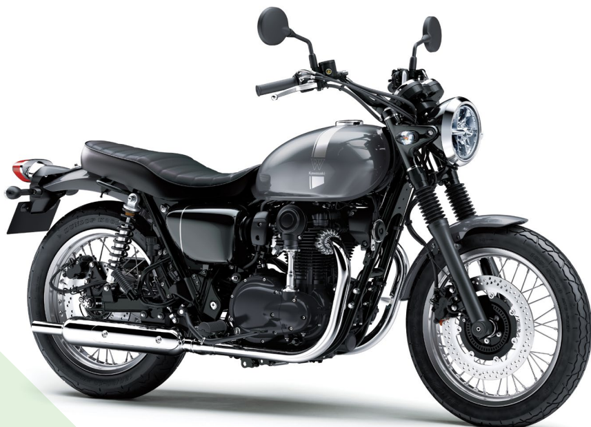
Pearl Storm Gray GY1