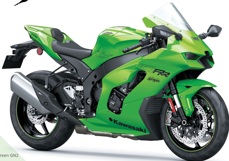
Lime Green GN2