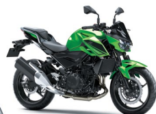
Candy Lime Green Type 3 with Metallic Flat Spark Black GN2