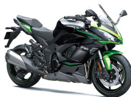
Ninja 1000 SX Emerald Blazed Green with Metallic Diablo Black GN1