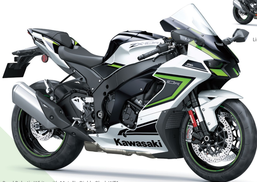
Pearl Robotic White with Metallic Diablo Black WT1