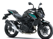
Metallic Matte Graphene Steel Gray with Metallic Spark Black GY1