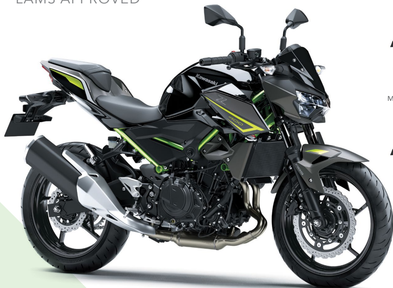
Metallic Spark Black with Metallic Matte Graphene Steel Gray BK1