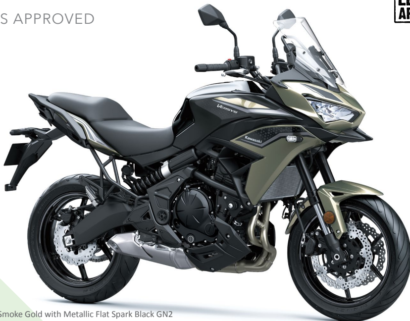
Metallic Smoke Gold with Metallic Flat Spark Black GN2