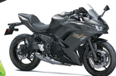
Metallic Matte Graphene Steel Gray with Ebony BK1