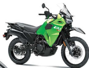
KLR650 Candy Lime Green Type 3 GN1 Model Code: KL650F

KLR650 Adventure Cypher Camo Gray (Matte) GY2 | Model Code: KL650H