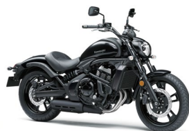
Metallic Flat Spark Black BK1