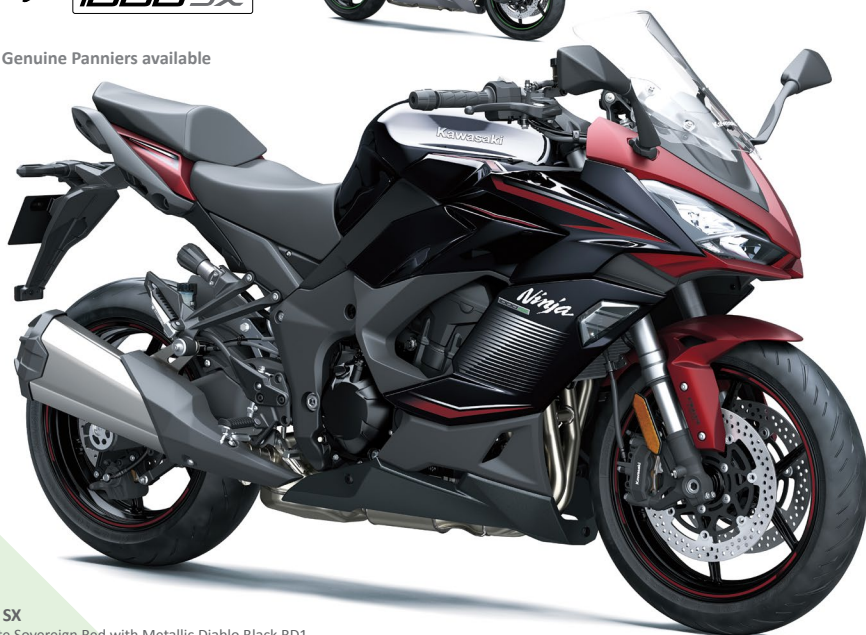
Ninja 1000 SX Metallic Matte Sovereign Red with Metallic Diablo Black RD1