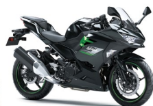
Ninja 400 Metallic Carbon Gray with Metallic Matte Carbon Gray GY1