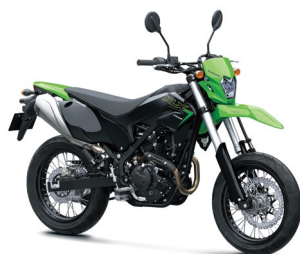
Lime Green GN1