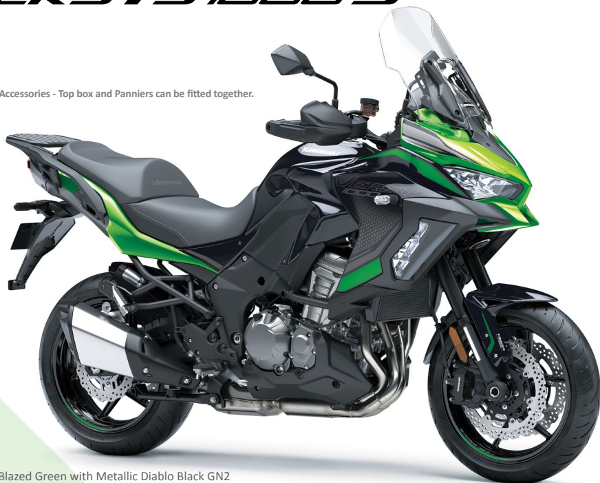
Emerald Blazed Green with Metallic Diablo Black GN2

*Optional Accessories - Top box and Panniers can be fitted together.