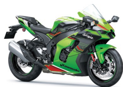
Lime Green with Ebony GN1